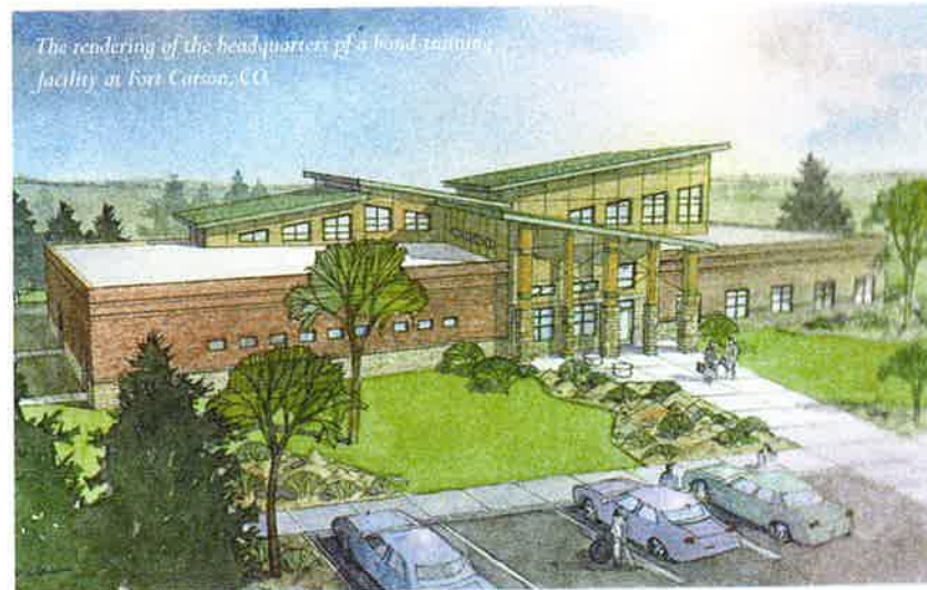
The rendering of the headquarters of a band training facility at Fort Carson, CO.

Because of the growing importance the Army Corps of Engineers has placed on